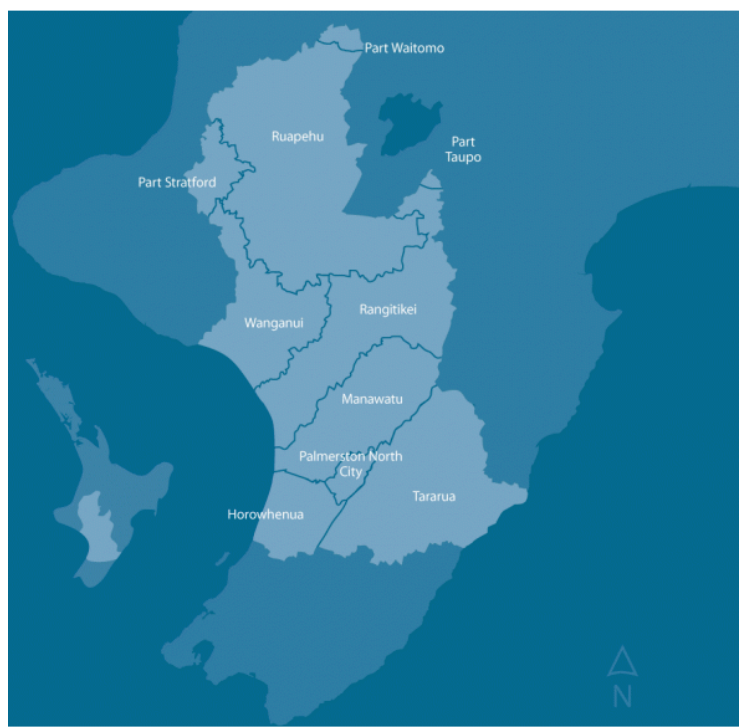
Figure 1: Manawatu-Wanganui Region (showing Territorial Local Authority Boundaries).

The region covers 10 local authorities, 7 completely within its boundaries. The area covers 22,215 \text{ km}^2 of land which is 8.1% of New Zealand's land area. Figure 1 shows the extent of the region.