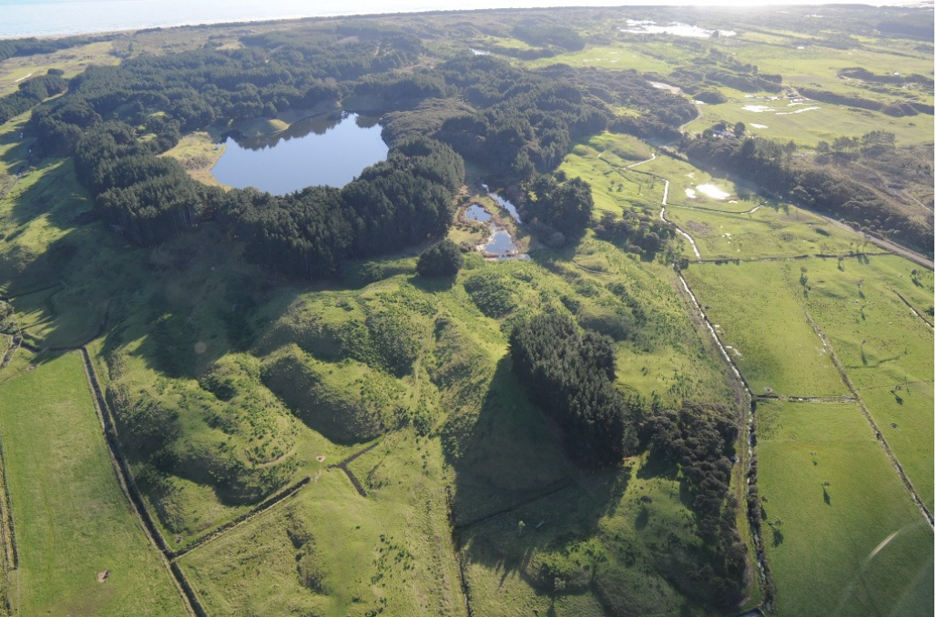
Figure 1: The Pot storage pond and irrigated plantation

on the wider water environment. With consent expiry looming, a good understanding of the effects to date were needed.