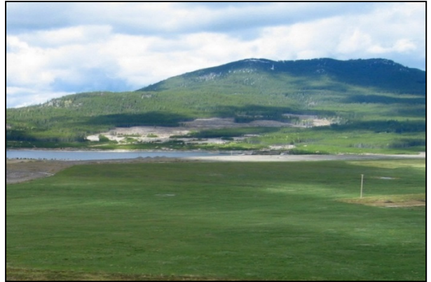
Rehabilitation of degraded land – mine site before (left) and after (right) biosolids application