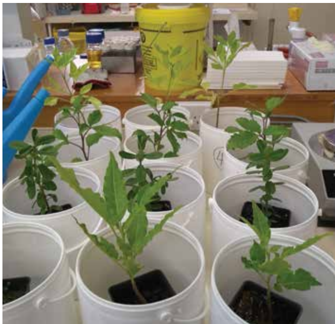
School project native plant species.

The day was split into three parts: an educational session and experimental design brainstorming for the student's project on plant health and greywater, followed by three practical laboratory activities, finishing with a site visit to a local property with a working greywater system. The hands-on laboratory activities were held in the microbiology laboratory, with the laboratory split into three separate activities.