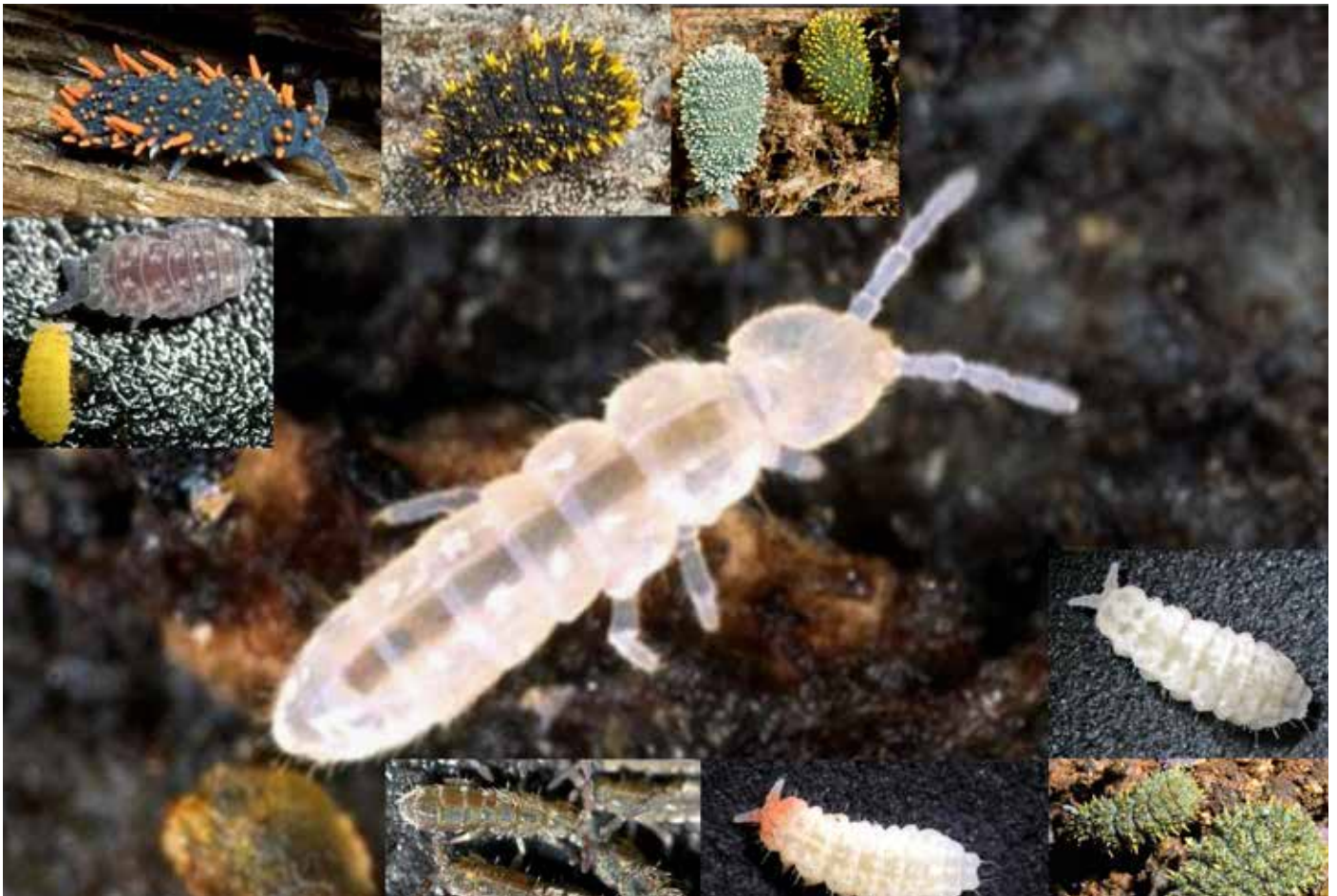
Figure: The OECD standard species Folsomia candida and a few of its New Zealand native springtail cousins.

Collembolans are hexapods with a thin exoskeleton that is highly permeable to air and water, and represents an arthropod species with a different route and a different rate of exposure compared to other soil invertebrate test species, such as earthworms. F. candida is distributed worldwide and is found in very high numbers at humus rich sites. It is an eyeless, unpigmented collembolan with a well-developed furca (jumping organ) and an active running movement. It can jump readily if disturbed. F. candida has an omnivorous feeding habit, including fungal hyphae, bacteria, protozoa and detritus in its food. It reproduces parthenogenetically but males may occur at less than 1 per thousand. That makes it a suitable model to assess the impacts of soil contaminants and the tests are performed according to a guideline (OECD 232; 2009). We continue to test the most persistent flame retardants in the soil both individually and in mixtures, as they are likely to be found in complex mixtures within the receiving environment. Opportunities are being explored to develop molecular approaches to better define the mechanisms of toxicity of these chemicals. So this small soil invertebrate is a very important tool in our objectives to assess the impacts of micro-pollutants on soil health.