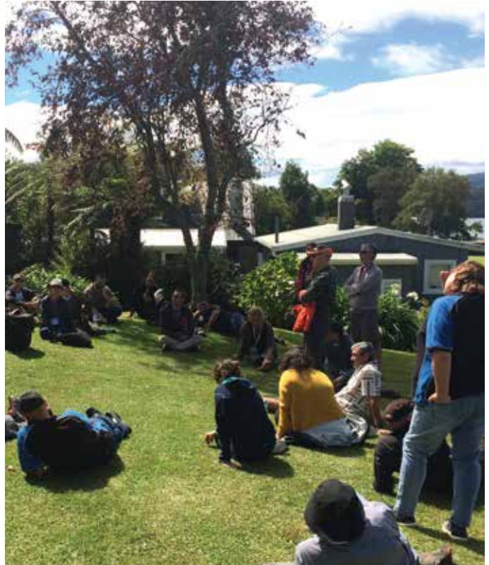
Site visit to a Lake Tarawera property, attendees talked about the process to petition the Rotorua Lakes District Council to have their community provided with a community wastewater system/connection (photo credit: Brent Fletcher of the Waikato Regional Council).