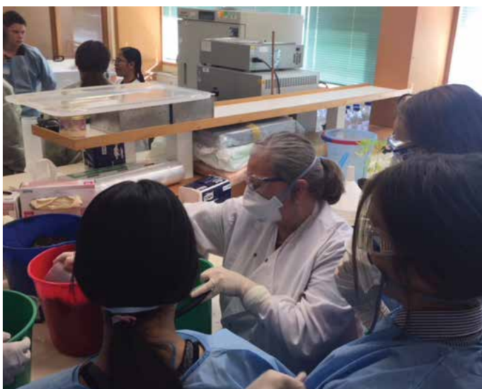
Bay 2 small lysimeters and cow manure slurries!