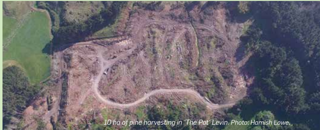
10 ha of pine harvesting in 'The Pot' Levin.

Tena koutou and welcome to our Winter newsletter. We are almost half way through 2018 and CIBR researchers are continuing to grow our knowledge for the beneficial and sustainable reuse and management of our biowaste. The CIBR team is very aware of the difficulties of these objectives, and has always advocated for long term research and solutions. In this newsletter, we present an update on three important long term programmes of biowaste research.