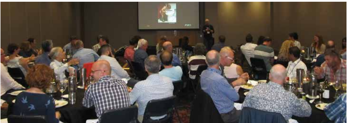
2018 NZLTC conference dinner