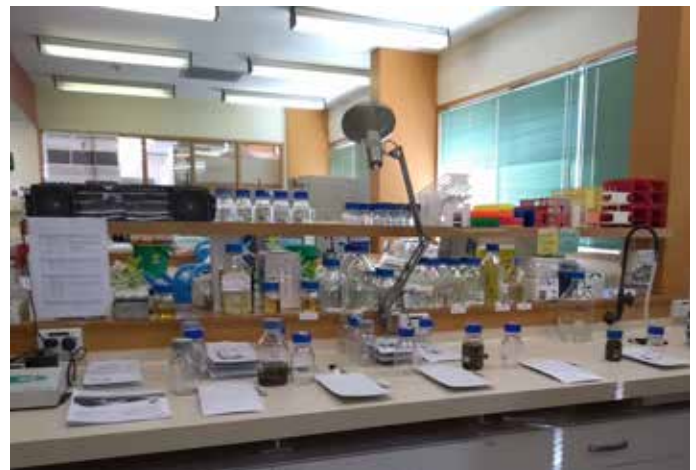
Microbial analysis practical exercise for visiting students.