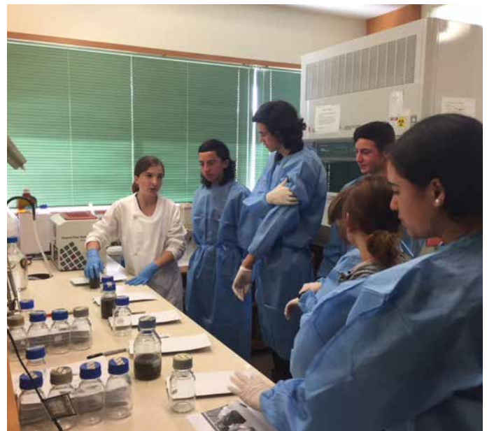
Bay 3 Microbial analysis.

The last part of the school visit was a trip to a local residential property that had installed their own greywater system. The students learned about the different components of a greywater system, to give them ideas for their own system. The day was very busy but successful, and much was learned by the team for use in future hosting activities!