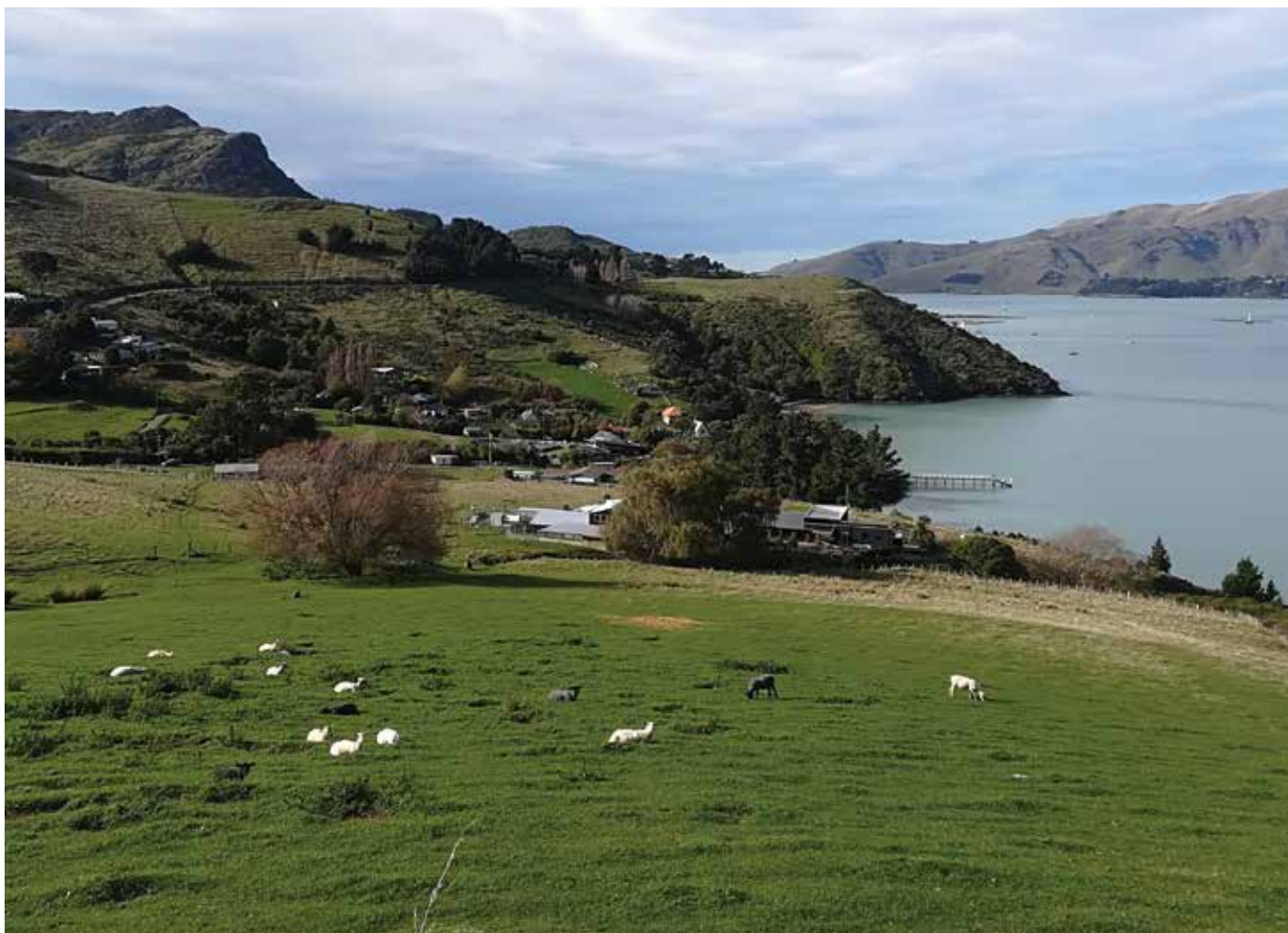
A view of Rāpaki in Whakaraupō (Lyttelton Harbour)