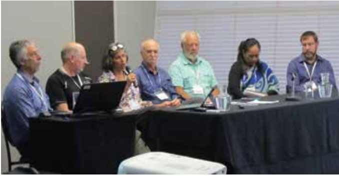
Panel discussion during the 2018 NZLTC conference