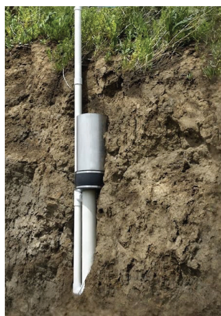
Picture of the soil flux meters that will be installed at The Pot trial site.

Next was the installation of specialised scientific equipment, water flux meters, that will measure the drainage water flow around the roots of the mānuka, kānuka and other plants. This will ultimately tell us what happens to different contaminants in the wastewater as they interact with the root systems of the plants.