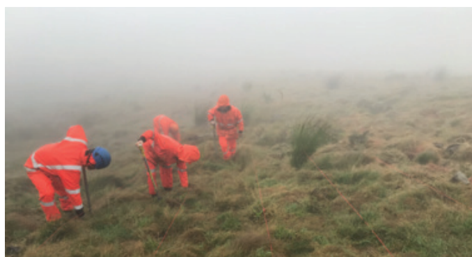
Figure 1. Planting a biosolids trial plot, April 2019 – at least the drought had broken!

The trial showed this soil needed at least 100 dry t/ha of the tested biosolids to overcome all limitations for pasture growth and very high rates to significantly improve the soil's plant-available moisture storage. Incorporating 100 or 200 dry t biosolids/ha delivered soil copper (Cu) and zinc (Zn) concentrations at less than half of 'threshold' values specified by national guidelines. Earlier research at the same site showed a pulse of leached N followed biosolids application, but this was short-lived even in treatments with high total N applied. This result is typical of biosolids containing N mostly in organic form. The trial also showed resource consent processes need to take into account individual biowaste sources, as aged biosolids had much lower leachable N than 'fresh' biosolids, and application limits for N should therefore be based on leachable N, not total N, which is often regulated at 200 kg/ha/annum.