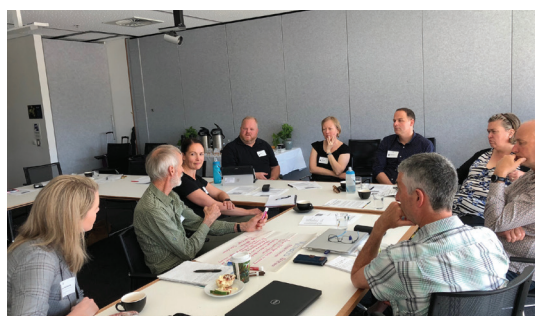
Figure 1. Participants at the What's in Our Water 2018 workshop in Canberra, Australia.

If you would like to subscribe to this newsletter please email izzie.alderton@esr.cri.nz with your contact details.