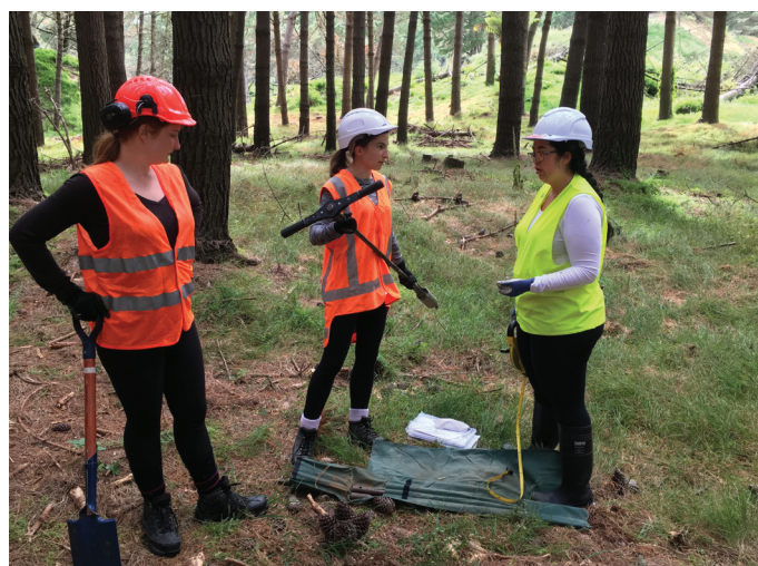
Base-line sampling before the pine trees were harvested Planting of the native trees by local iwi, council members and the CIBR team

Over the last six months, >70,000 native trees have been planted at the site and over 350 soil samples have been taken. The soil sampling at this early stage will give the scientists a baseline to compare against once the trial is finished. The natives largely consist of mānuka and kānuka, but also include more than 20 other native species. The planting has been undertaken in a specially designed way to allow the scientists to compare the different species, with measurements of growth and drainage water.