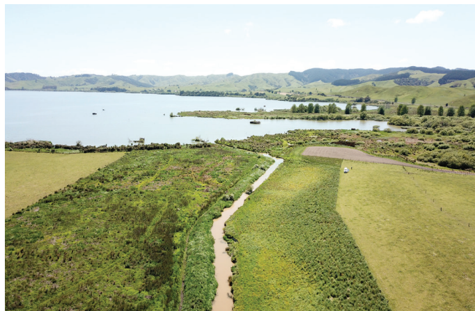
Lake Waikare: 4 ha of mānuka dominated ecosystems planted at Lake Waikare, in the Waikato in collaboration with Waikato River Authority, Waikato Regional Council, Ngā Muka, and Nikau Trust Farm.

'The Pot' at Levin is the latest field site to be planted with an mānuka, kānuka dominated ecosystem. Other field sites include a plots of land on the shores of Lake Waikare, Lake Wairarapa, and Duvauchelle.