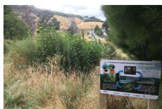
Duvauchelle: the trial at Duvauchelle in year 1 (left) and year 3 (right), in collaboration with Christchurch City Council.

Funded by the Freshwater Improvement Fund from the Ministry for the Environment, and Horowhenua District Council, a 10 hectare trial at The Pot is underway. Mānuka, kānuka and 12 other NZ-native species have replaced radiata pine at the Pot and over the next five years the team will investigate if this special plant can enhance the land treatment of wastewater.