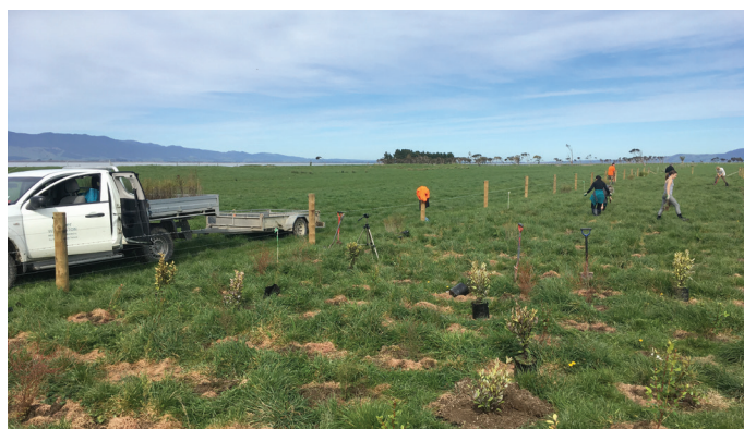
Lake Wairarapa: Planting in the Wairarapa Moana in collaboration with farm owners, Greater Wellington Regional Council, and Ngāsti Kahungunu ki Wairarapa.