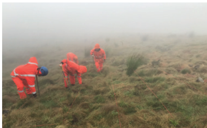
Figure 2. Measuring a revegetated area at Stockton mine where nursery-raised native seedlings were planted in 1999 into stripped soils in the absence of biosolids. Growth rates are a relatively slow 5 to 7 cm p.a. Beech, flax (and totara) are in the foreground, rātā and mānuka in the background (photo March 2019).